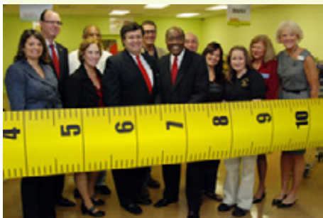
A grand opening ceremony was held for The Broward Education Foundation's Kids in Need Resource Center, now in its new location in Pompano Beach.

On January 26, the Kids in Need Resource Center held the grand opening of its new location in Pompano Beach.