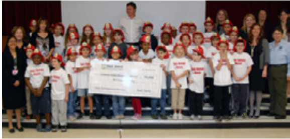
Coconut Creek Elementary School students hold the $10,000 check they earned by creating the grand prize-winning fire safety video.