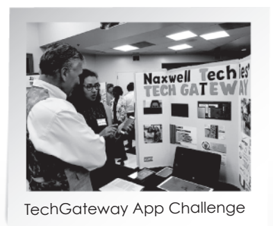
TechGateway App Challenge

incorporates the TechGateway map and initiative to increase awareness about technology companies doing business in South Florida.