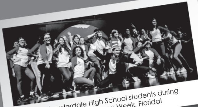
Fort Lauderdale High School students during Celebrate Literacy Week, Florida!

BCPS was selected by the state to host the ninth Annual Celebrate Literacy Week, Florida! kick-off event on January 23, 2017. This year's theme was "Literacy Changes Our World." Florida First Lady Ann Scott joined the festivities at Fort Lauderdale High School, along with Department of Education and Florida Lottery officials, community dignitaries and, author and prize-winning novelist Brad Meltzer. Students from Fort Lauderdale High School, Bennett Elementary School, Walker Elementary School, Wilton Manors Elementary School and Sunrise Middle School performed during the event.