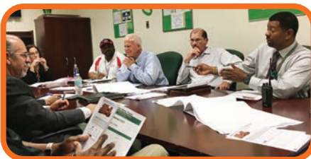
Blanche Ely High School Facilities Meeting

Information on the status of SMART projects at individual schools is also available online. Visit browardschools.com/School-Info/SmartSchools to learn more.