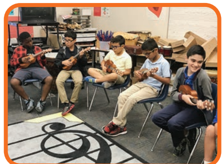
Coconut Palm Elementary students playing new ukuleles

For more information about the SMART Initiative, visit browardschools.com/smarthutures .