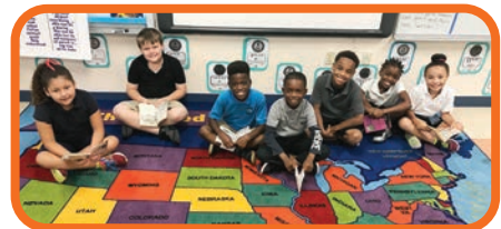
Discovery Elementary School