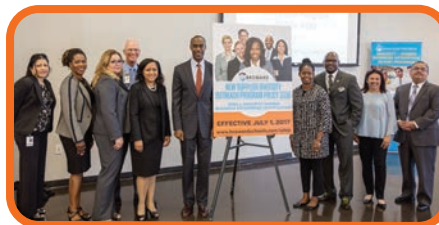
New Supplier Diversity Outreach Program Policy Event