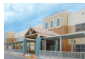
Orange Brook Elementary

Nearly 2,600 students arrived at their schools in Hollywood and Miramar to see brand new classrooms, cafeterias, media centers and gymnasiums. Monday, August 20 marked the openings of new campuses at Orange Brook Elementary School and Glades Middle School.