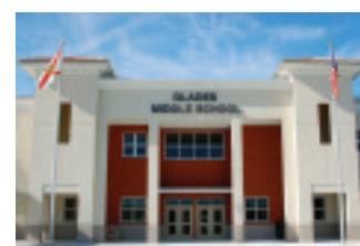
Glades Middle School