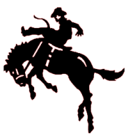
Cooper City High School

It's tradition of the "Cooper City Five" to provide relevant and rigorous instruction to our students, and service to families and community.