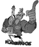
Embassy Creek Elementary