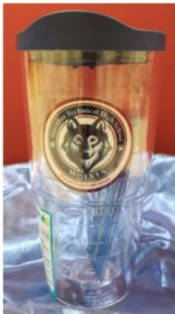
The 24 oz is $22