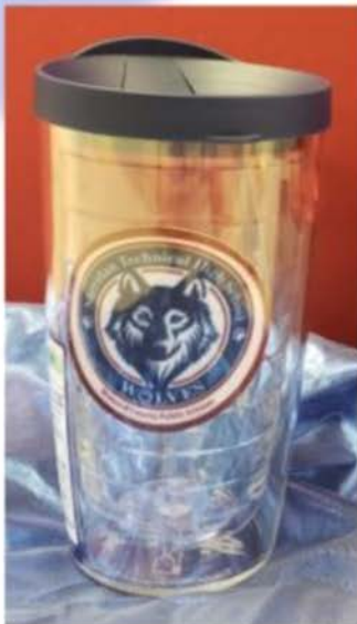
The 16 oz. sells for only $20.

Show your school spirit and look cool with these exclusive, limited edition Sheridan Tech tumblers. Made by Tervis (a Florida company), each double-wall insulated tumbler is dishwasher safe and comes with a lifetime warranty. They are also the only beverage holder that is classroom approved!