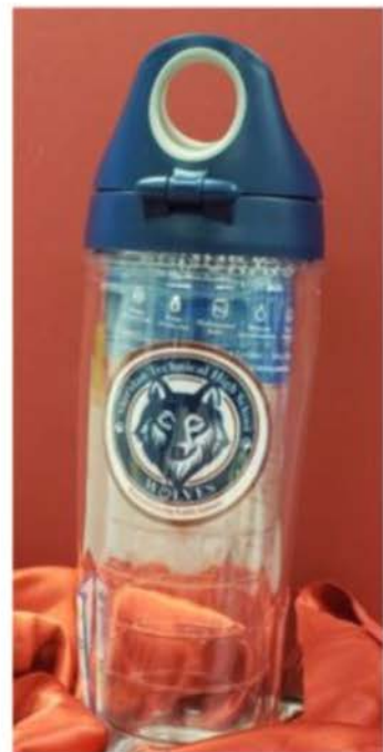
The water bottle is $24