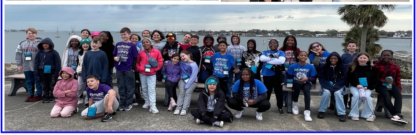
Fourth Grade Black History Month Projects