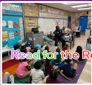
Read for the Record Day 2021

We would love to include some pictures from our Trunk or Treat, Red Ribbon or Storybook Parade. If you would like to share your pictures with our Yearbook Staff, please email them to mge_parent@browardschools.com