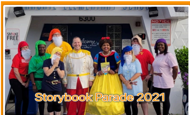
Storybook Parade 2021