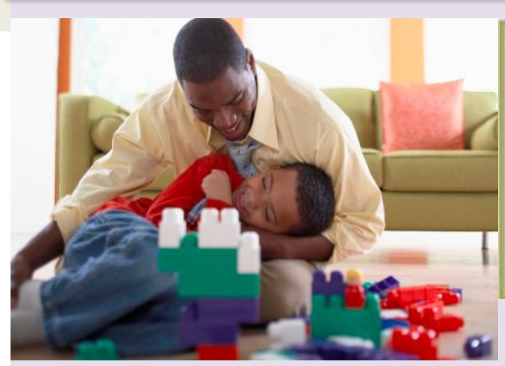
Make yourself the reinforcer!

Pairing- The process to help form and maintain rapport with a child by combining (i.e. pairing) the learning environment and the parent with already established reinforcers.