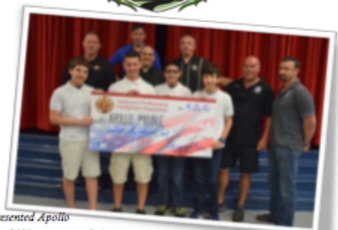
Hollywood Professional Firefighters Association presented Apollo National History Fair Participants with a check for $600 to support their travels to Tallahassee, Florida.