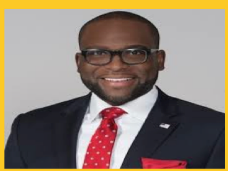
featuring Guest Speaker