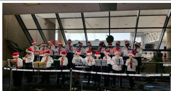
Challenger Recorder Club performed for the holidays at the City of Tamarac and Ft. Lauderdale Airport.