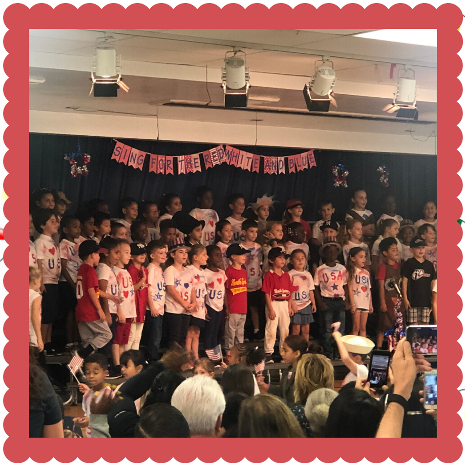
1st Grade did a fantastic job with their play honoring our Veterans!