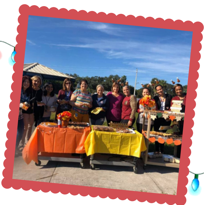
Admin team sharing treats & giving thanks for our Amazing Staff!