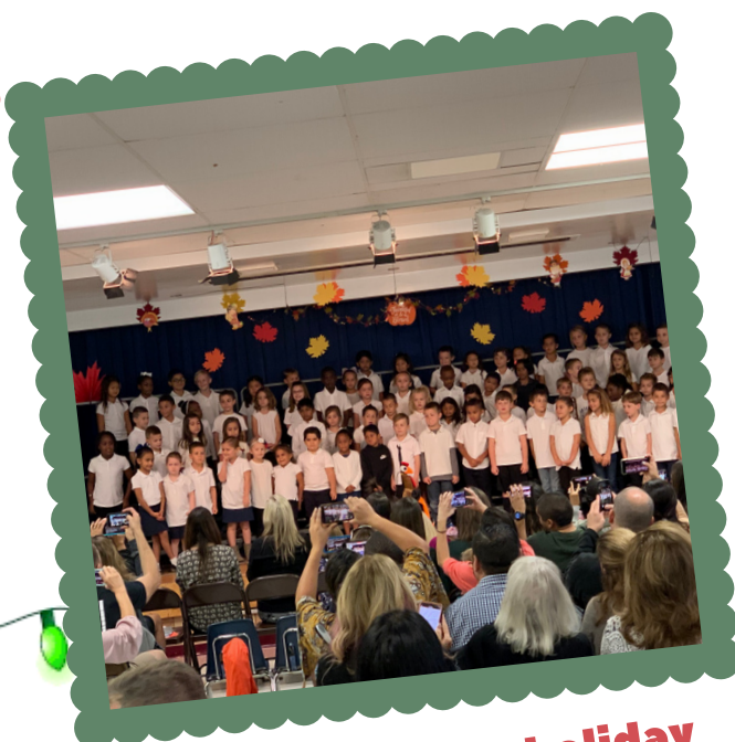
K put on a great holiday show for their families!