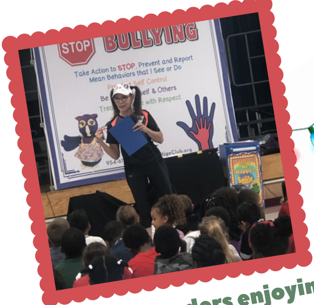
Our 2nd Graders enjoying a presentation on Bullying