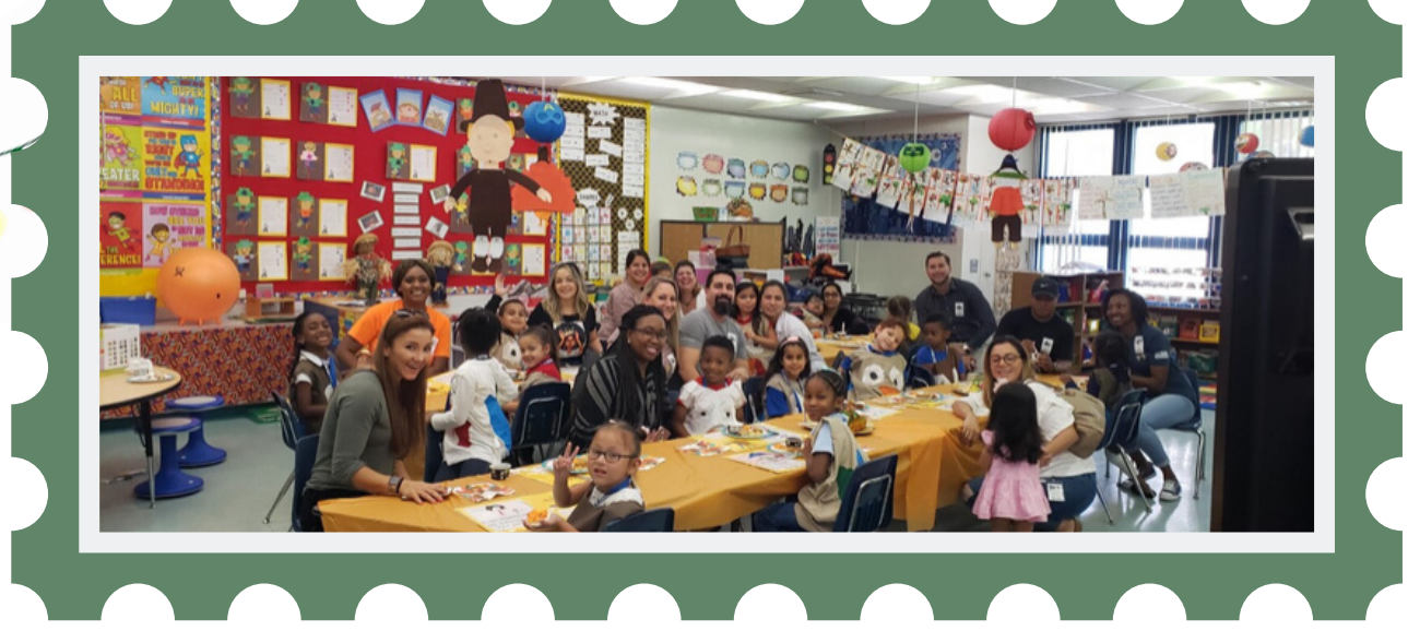
Kindergarten had such fun with their Pie Tastings!