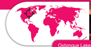
Oxtongue Lake, Dwight, Ontario, Canada