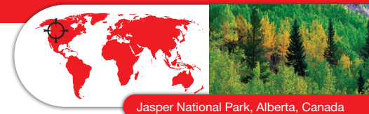
Jasper National Park, Alberta, Canada