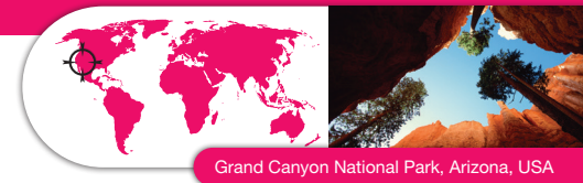
Grand Canyon National Park, Arizona, USA