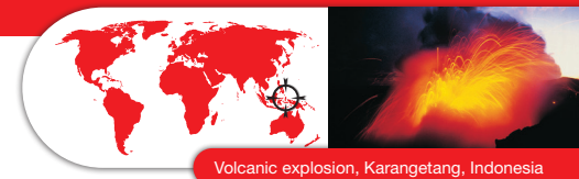
Volcanic explosion, Karangetang, Indonesia