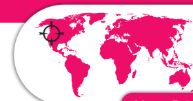
Mount Rainier, Washington, USA