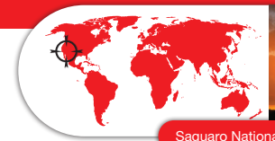
Saguaro National Park, Arizona, USA