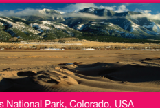
Great Sand Dunes National Park, Colorado, USA