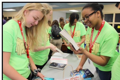
Team selects free books for their personal libraries.