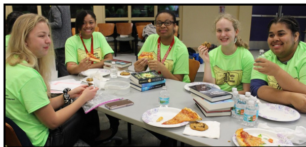
Team members enjoy a pizza lunch.