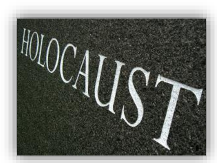
New England Holocaust Memorial, Boston

Office (954) 929-5690 Website: <a href="www.hdec.org">www.hdec.org</a> Email: <a href="mailto:rositta@hdec.org">rositta@hdec.org</a>