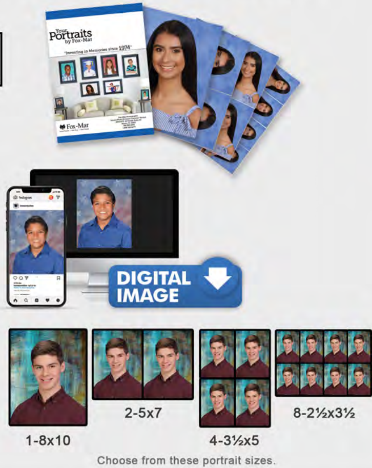
Choose from these portrait sizes.