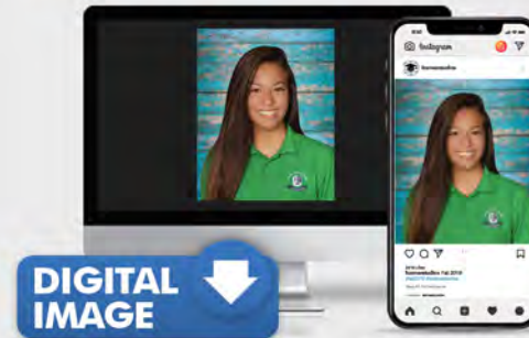
HIGH RES IMAGES