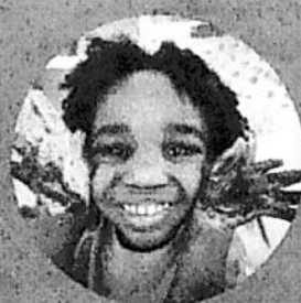
ART AND CRAFTS