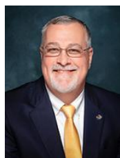
Senator Ben Albritton (R)