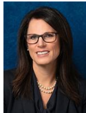
Senator Tina Scott Polsky (D)