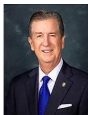
Senator Jim Boyd (R)