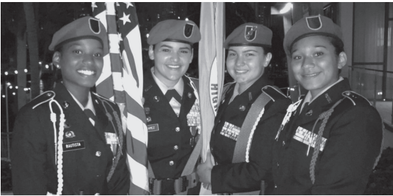
South Broward High School Army JROTC