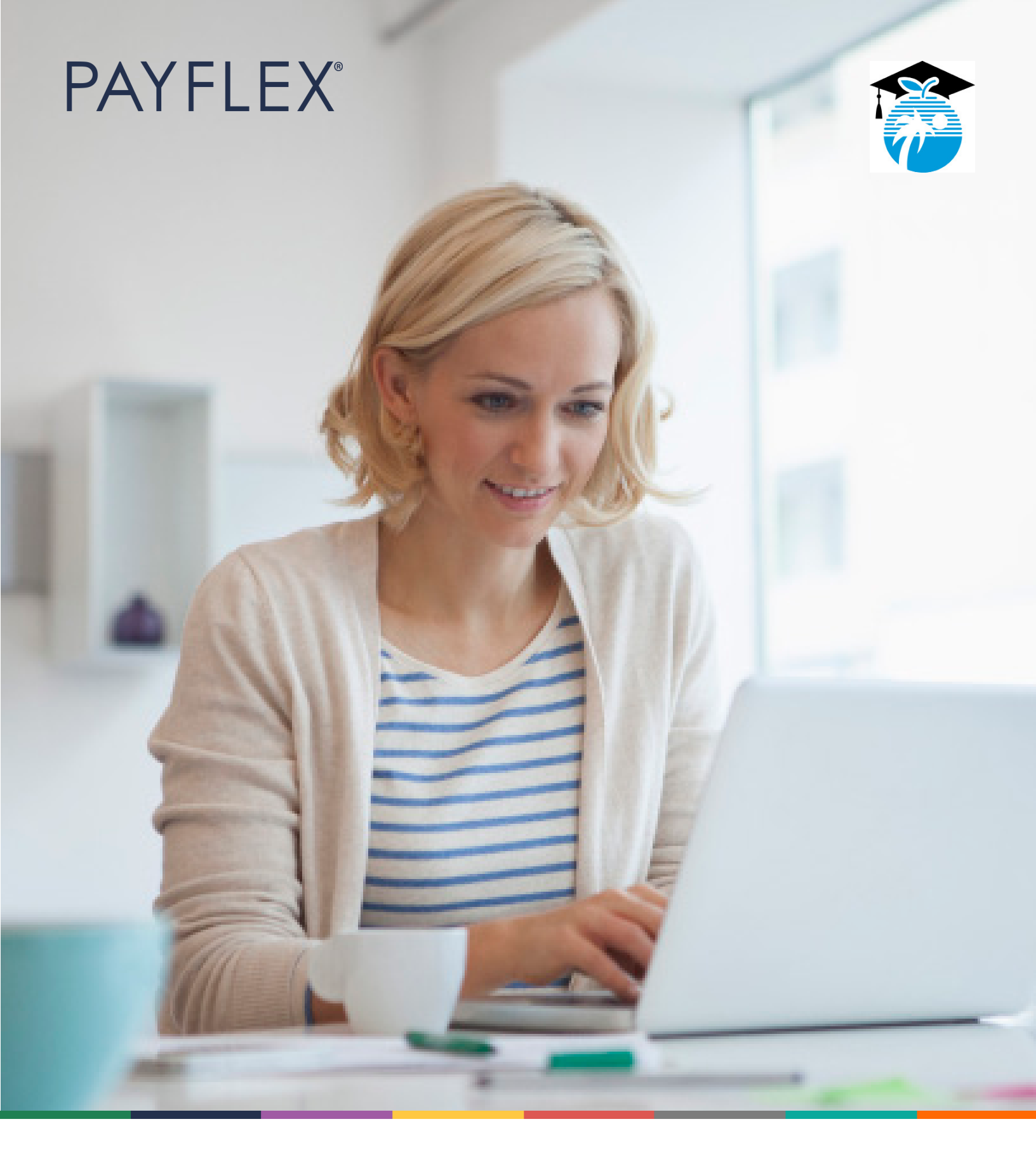
Your Flexible Spending Account (FSA) Guide

Plan Year: January 1, 2018 - December 31, 2018