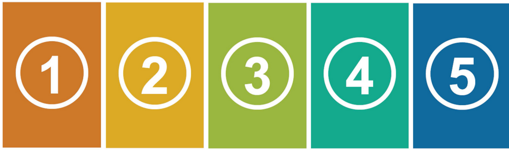
Table 1. Performance Levels