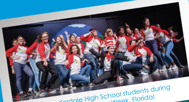
Fort Lauderdale High School students during Celebrate Literacy Week, Florida!