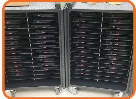
Cypress Run Education Center Laptops and Secure Storage