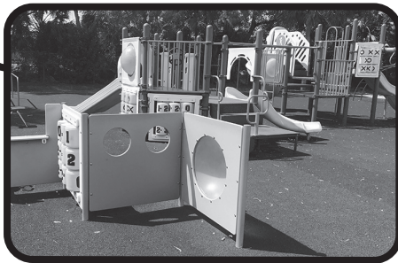
Cypress Elementary School