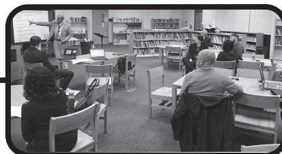
Pompano Beach Elementary