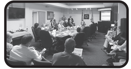
Fort Lauderdale Council of Civic Associations - March 14, 2017

In addition to the community presentations, members of the public can learn more about the status of SMART projects at individual schools by visiting browardschools.com/School-Info/smartschools .