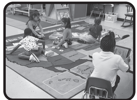
New colorful carpets for Oakridge Elementary classrooms