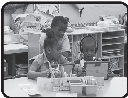
Oakridge Elementary students learn with new iPads

As we move forward with our SMART facility projects, we are making improvements to our campus by completing our single point of entry, adding sidewalks, installing new roofs on multiple buildings, stuccoing walls and updating windows where needed, renovating our HVAC system, and renovating or replacing our school cafeteria. Oakridge Owls are now prepared to Soar to New Heights! Thank you to our entire community for supporting SMART!