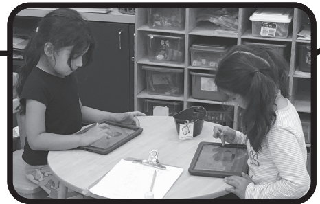
Oakridge Elementary School