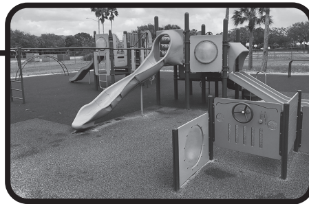
Eagle Ridge Elementary School