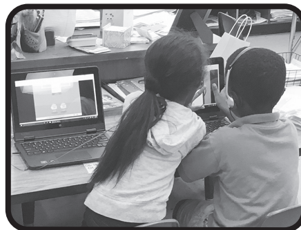
Oakridge Elementary students using new laptops