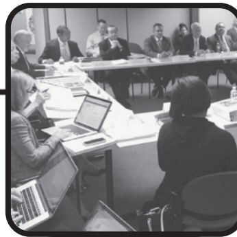
Bond Oversight Committee Meeting – November 14, 2016