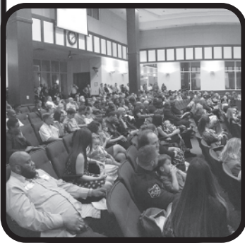
City of Miramar Municipal Meeting – November 2, 2016