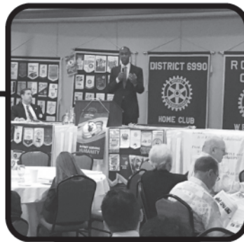
Weston Rotary Club – November 10, 2016