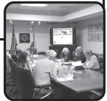
Fort Lauderdale Education Advisory Board Meeting – November 17, 2016