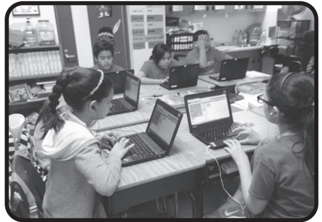
Sandpiper Elementary School