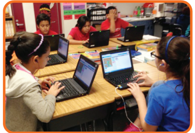
Sandpiper Elementary School