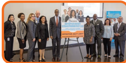
New Supplier Diversity Outreach Program Policy Event