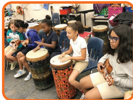
Coconut Palm Elementary students enjoying new musical instruments