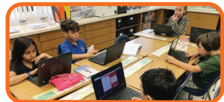
Margate Elementary School