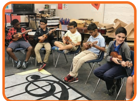
Coconut Palm Elementary students playing new ukuleles

For more information about the SMART Initiative, visit browardschools.com/smartfutures .