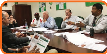
Blanche Ely High School Facilities Meeting

Information on the status of SMART projects at individual schools is also available online. Visit browardschools.com/School-Info/SmartSchools to learn more.