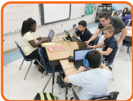
Coconut Palm Elementary students using new laptops

The SMART bond School Choice Enhancement Program funding also allowed us to make playground improvements, such as installing a rubber surface for our playground and awnings for shade. In addition, our music program is improved by the purchase of new instruments and a sound system. Our musical productions will look very professional in the upcoming school year. Thank you to our community for supporting the SMART program.