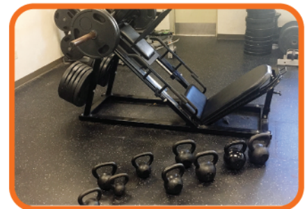
West Broward High School