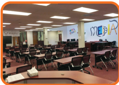
Attucks Middle School