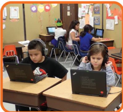
Tamarac Elementary School