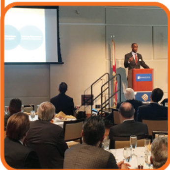
Broward Workshop Education & Youth and Advocacy Committee – October 5, 2016