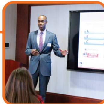
Community Foundation of Broward Executive Committee Meeting – October 25, 2016