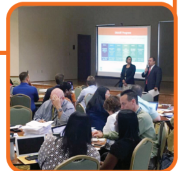
Elementary School Principals Meeting – October 27, 2016