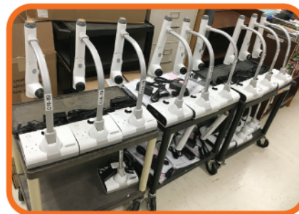
Coral Springs High School