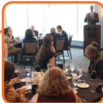
Tower Club Real Estate Forum – October 13, 2016