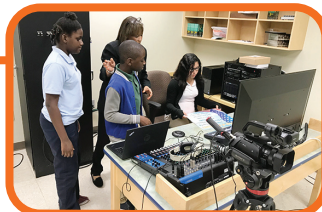
Pine Ridge Education Center