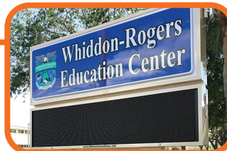
Whiddon-Rogers Education Center