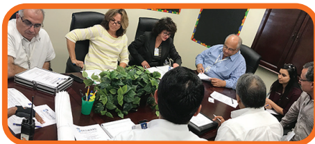
Deerfield Park Elementary School Pre-Construction Meeting