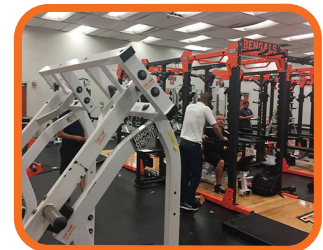
Piper High School Weight Room

"I am excited about the opportunities this new state-of-the-art weight room will offer ALL students at Piper High School. This is the type of educational offering that goes beyond the scope of a textbook and translates into hands-on education, in this case learning about the importance of a healthy lifestyle for all athletes and nonathletes. Our new weight room is possible because of the sound utilization of the SMART General Bond initiative. Thank you Broward County residents and thank you Broward County Public Schools."