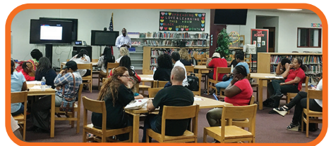
McNicol Middle School Project Charter Meeting