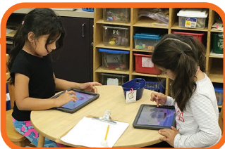
Oakridge Elementary School