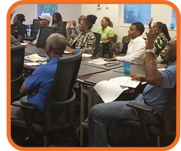
Minority Builder's Coalition Annual Meeting

To learn more about how to do business with BCPS, visit broward.k12.fl.us/supply/sdop .