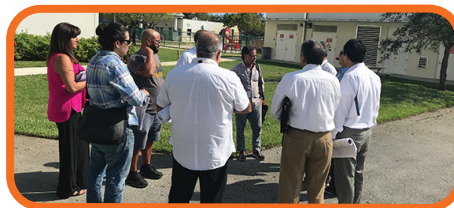
Hollywood Hills Elementary School Pre-Construction Meeting