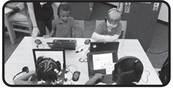
Bennett Elementary School