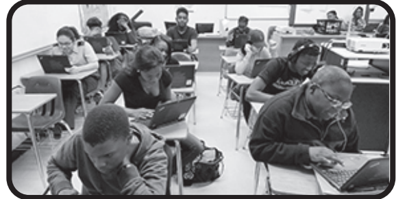
Coconut Creek High School