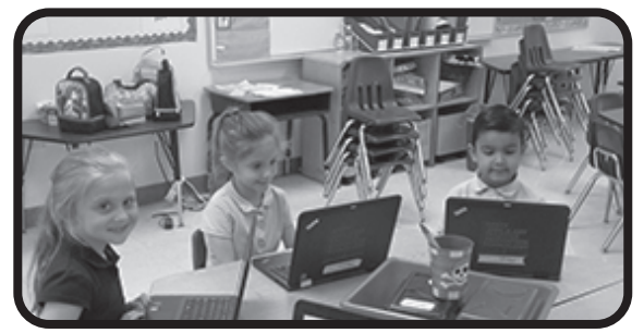
Maplewood Elementary School