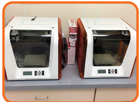
Manatee Bay Elementary School 3-D Printers