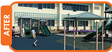
Norcrest Elementary School