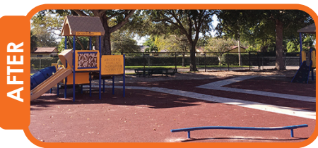
Forest Hills Elementary School