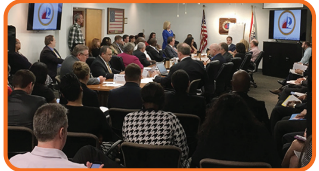
Fort Lauderdale City Commission - December 15, 2016