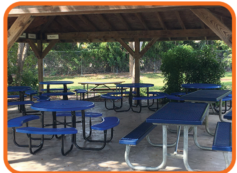
Cypress Elementary School Picnic Tables